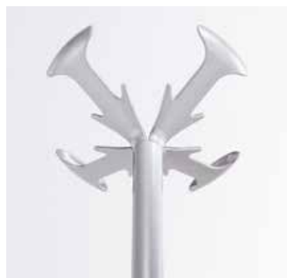
Detail of black and grey head