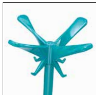
1486-OT Blu acqua (RAL 2002) lucido