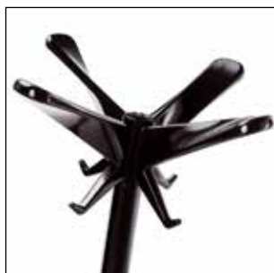
1486-N Nero lucido