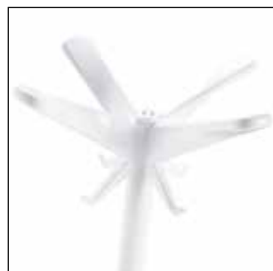
1486-B Bianco lucido