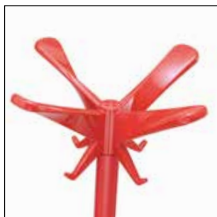
1486-AR Arancione rosso (RAL 2002) lucido